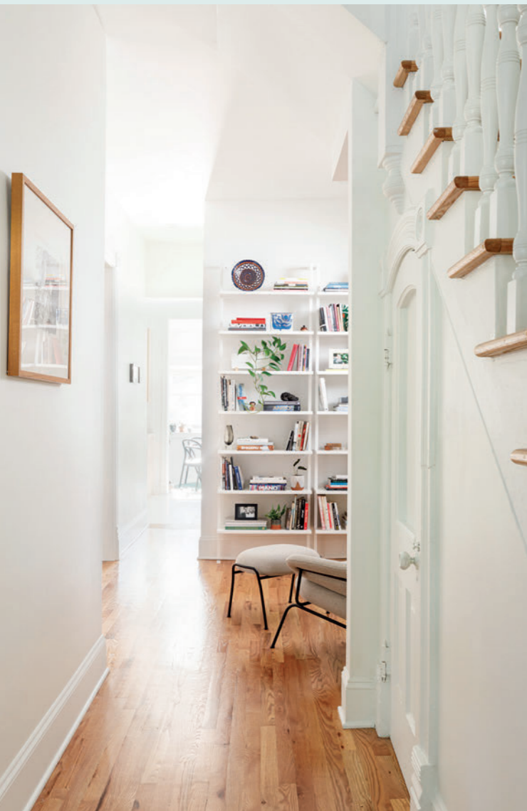
ABOVE Walls lined with bookshelves and a comfy armchair turned an open area at the far end of the entrance hall into a cosy reading nook. The door beneath the staircase leads down to a basement laundry room

‘My plan was to preserve as many of the original spaces as possible, only making significant changes to the newer additions’