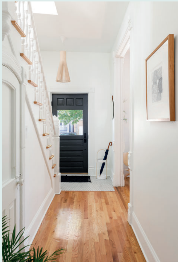
ABOVE The architrave around the front door is new. It was made to match the original Victorian woodwork in the downstairs rooms

LOCATION Chicago, USA TYPE OF PROPERTY Remodelled detached cottage BEDROOMS 4 PROJECT STARTED August 2019 PROJECT FINISHED February 2020 SIZE 180sqm PROPERTY COST Around £386,500 BUILD COST Around £1,184 per sqm