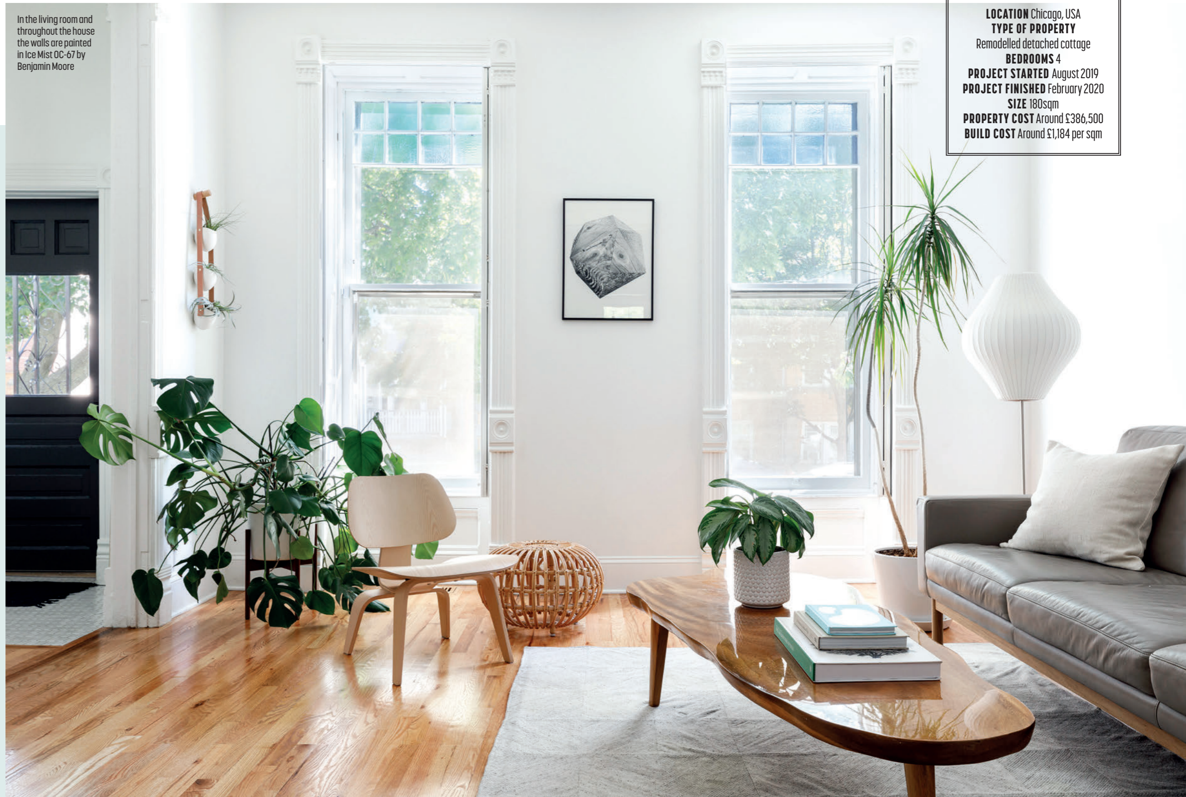
In the living room and throughout the house the walls are painted in Ice Mist OC-67 by Benjamin Moore

The cottage is on a plot measuring 7.6m wide by 38m long – a fairly standard size for the city. But the long and narrow dimensions together with the proximity of the »