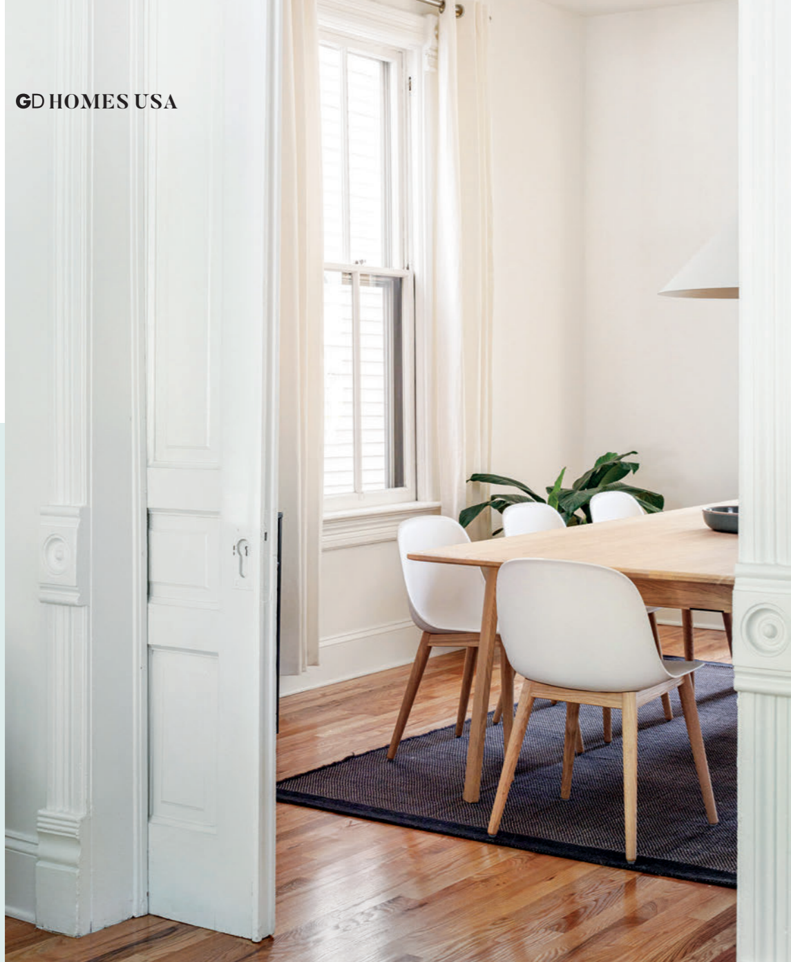
LEFT A pocket door between the living room and dining room is original to the cottage. The Alle table from Hem is teamed with eight Fiber chairs from Muuto RIGHT The solid northern red oak flooring was laid by the house's previous owners