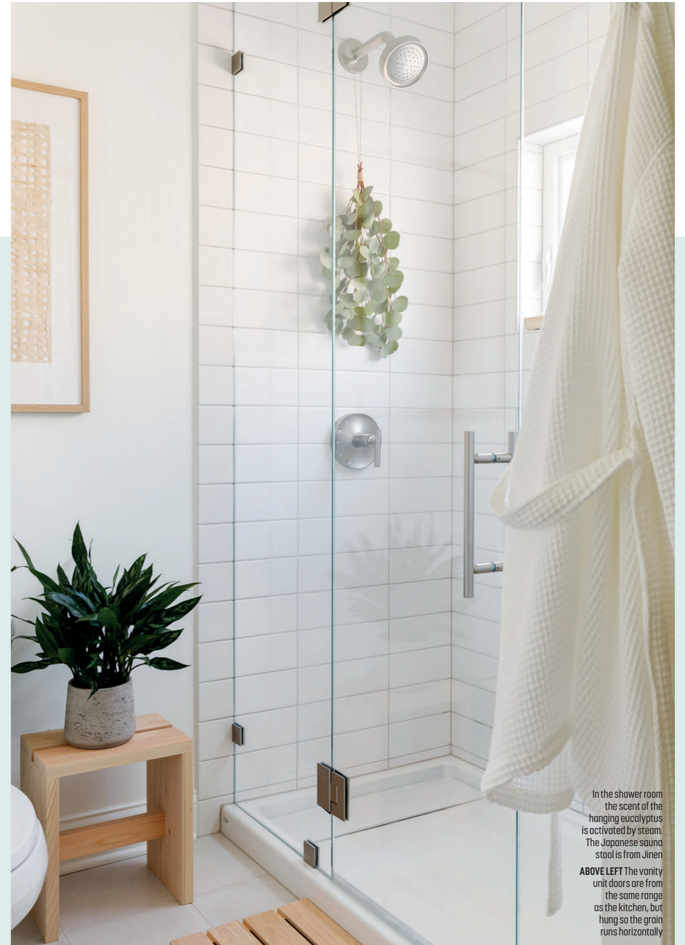
In the shower room the scent of the hanging eucalyptus is activated by steam. The Japanese sauna stool is from Jinen

Danielle carried on with her fulltime job while project managing both build phases to make sure everything ran smoothly. It wasn’t all without incident though, particularly when the temperature dropped below freezing just as >>