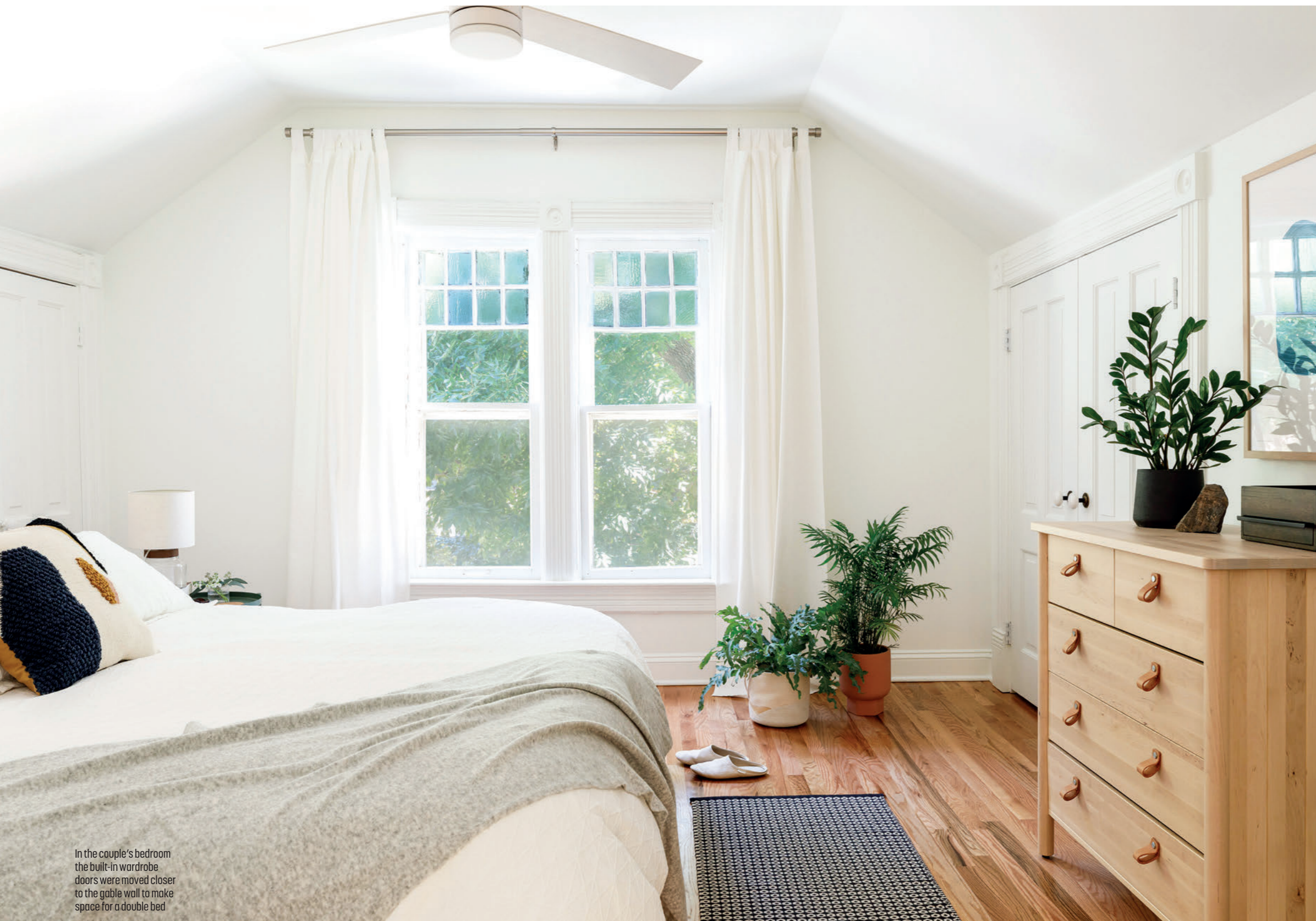
In the couple's bedroom the built-in wardrobe doors were moved closer to the gable wall to make space for a double bed